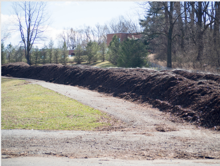
Photo: Caln Township Leaf Composting Facility