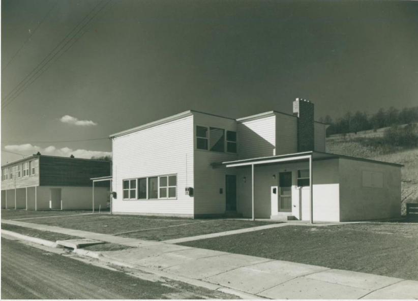
A type "A" four-plex, with two units up and two down with a type "C" duplex in the background.