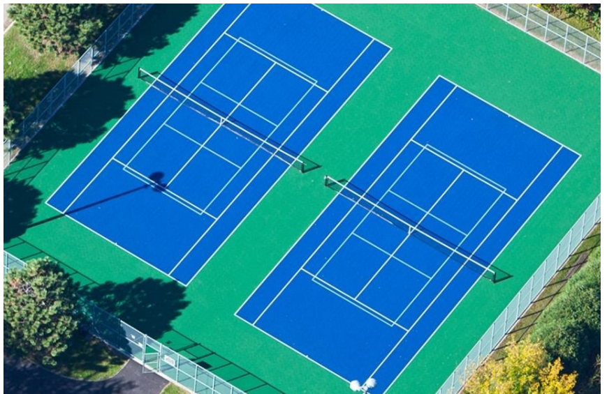
Above: A sample of the updated design - the pickle-ball lines are in light blue and the tennis lines are in white.

This summer, Public Works crews will be performing badly-needed updates on the tennis courts in Caln Municipal Park. In June, the old posts and nets will be replaced and the courts will be closed for a couple of days to allow the new concrete to set. Then, the week of August 21, the courts will be completely resurfaced. The new color scheme (also used by the U.S. Open) maximizes visibility and reflects more sunlight, making for a cooler, more environmentally-friendly courts. We'll also be adding contrasting lines for pickle ball! Signs will be posted to alert park users when the courts are closed.