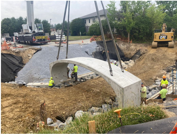
Left: June 12, first bridge span being moved into place on top of the filled-in footers.