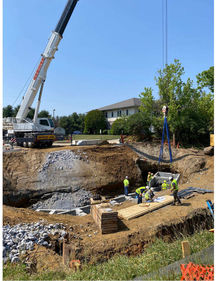
Above: June 2nd, crews installing pre-cast footer which were then filled with concrete